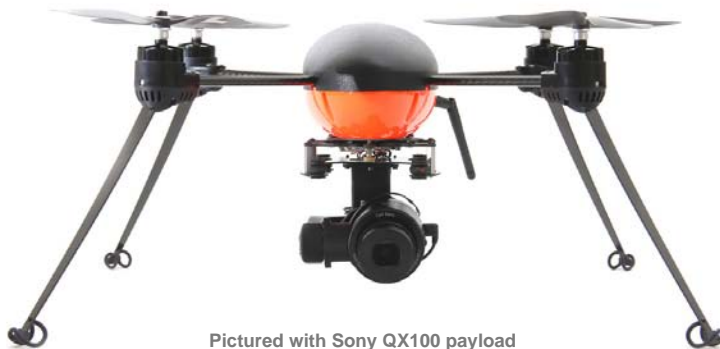
Pictured with Sony QX100 payload