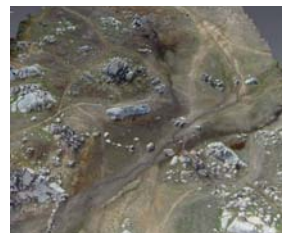
3D Modeling and Mapping