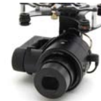
Sony QX100 2-axis Gimbal