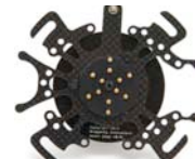
Quick Release Payload System