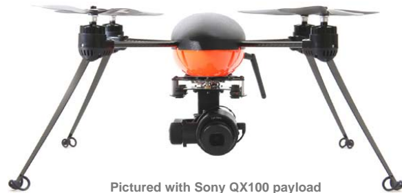
Pictured with Sony QX100 payload