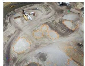
Inventory & Waste Calculations